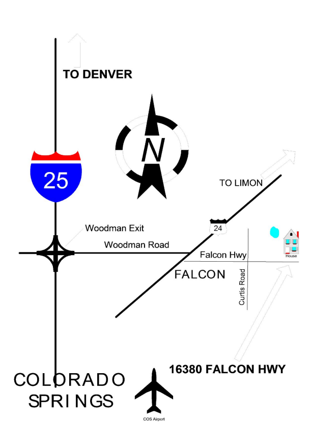
From I-25 North or South: Take Woodmen Road Exit and travel east to Highway 24. Turn Right on Highway 24 and then turn Left on Meridian. Go to stop sign and then Turn Left on Falcon Highway. Turn Left in driveway at 16380 Falcon Highway.